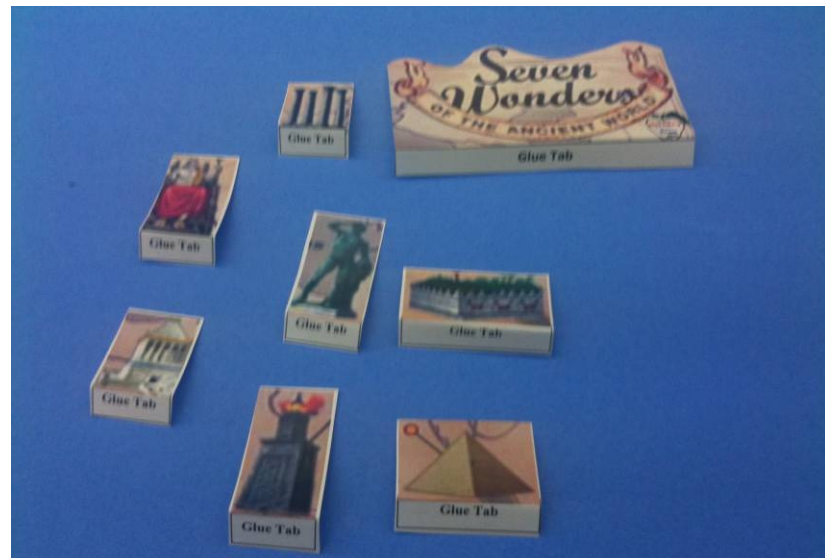
Fold BACK Glue Tabs