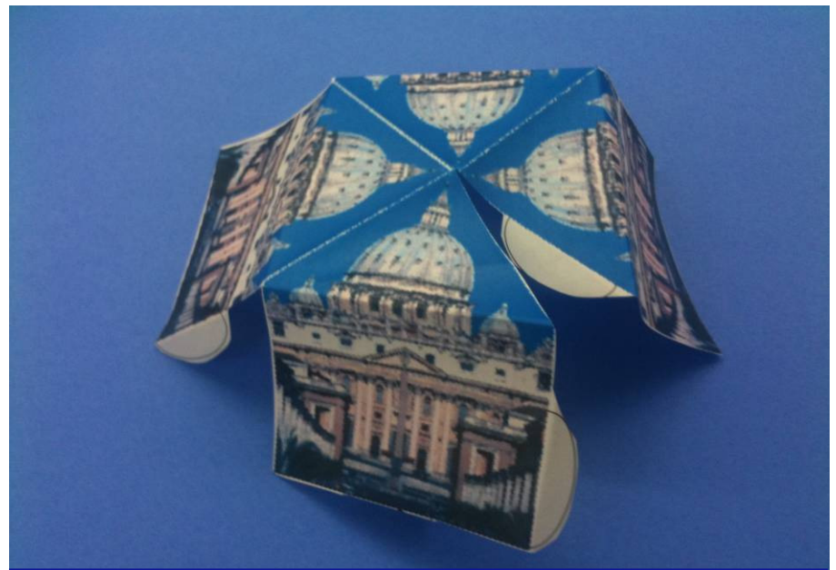
Fold BACK "Triangles", "Squares", & Glue Tabs