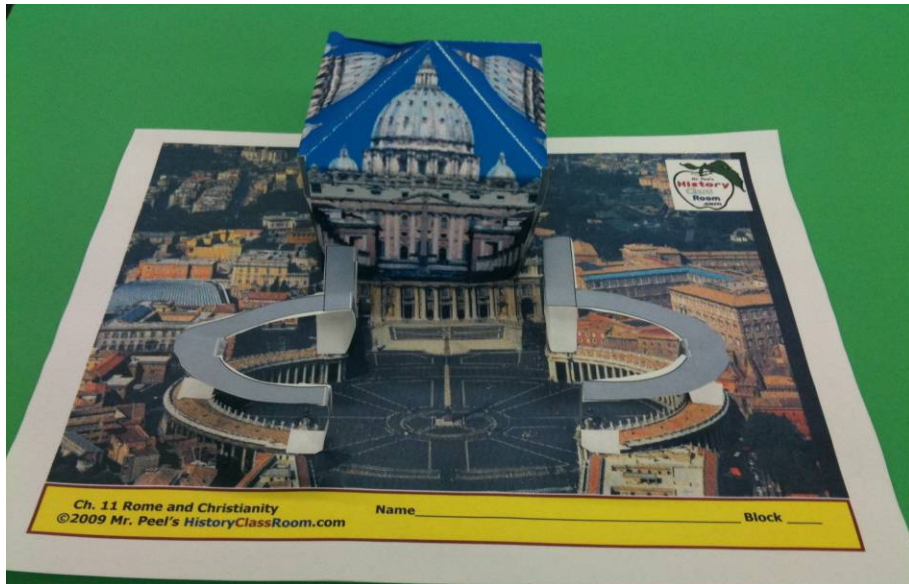
Glue Map & Timeline on back, Glue "Arches" & St. Peter's Basilica on the front of Picture.